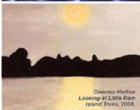
Coecles Harbor Looking at Little Ram Island Trees, 2008.