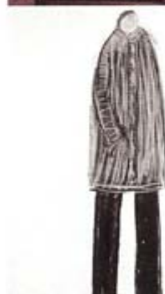
Spy, 2008. See Resources.