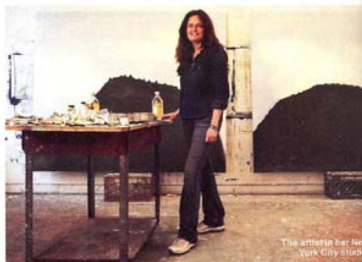
The artist in her New York City studio.