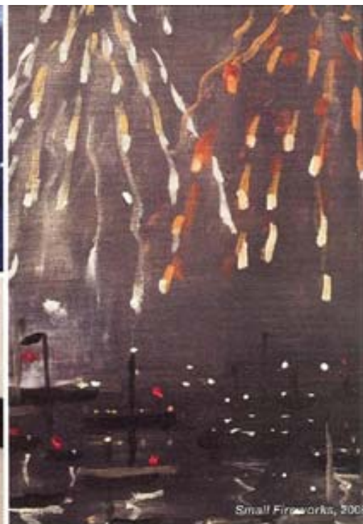
Small Fireworks, 2008.