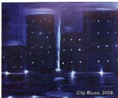
City Blues, 2008.