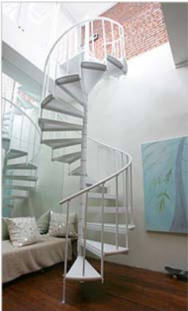
A staircase goes to the roof.