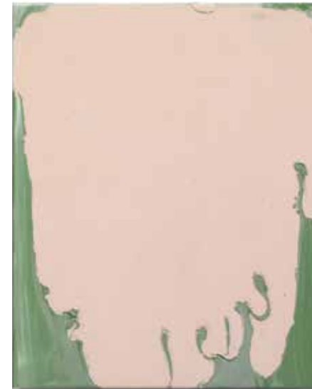
ABOVE LEFT: Mary Bucci McCoy In Green , 2013 Acrylic on panel 10.5" x 8.5"