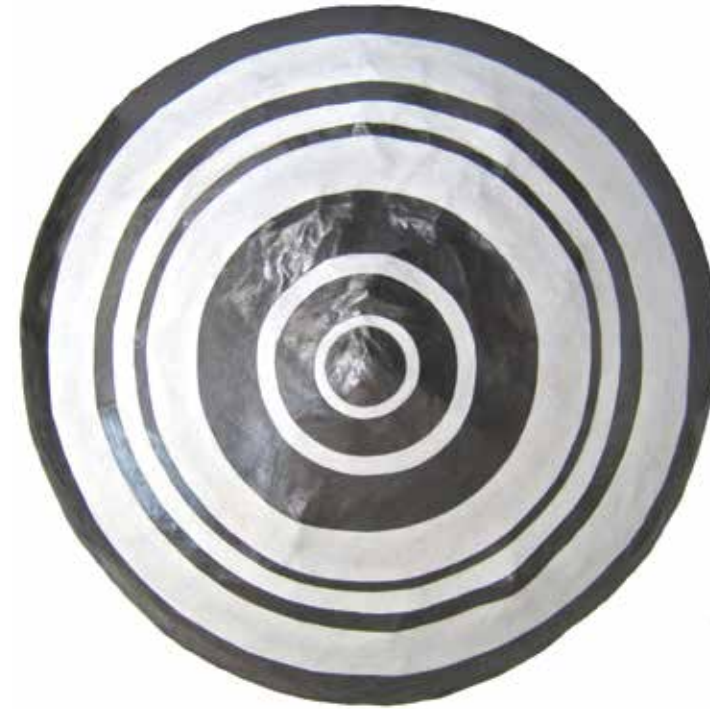
LEFT: Katharine Umsted Shield , 2015 Graphite and gesso on mixed media. 26.5" × 26.5" × 4"