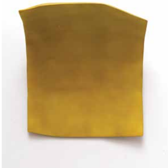
BOTTOM: Jaena Kwon Skyfall , 2015 Acrylic on MDF 25" x 21" x 3"