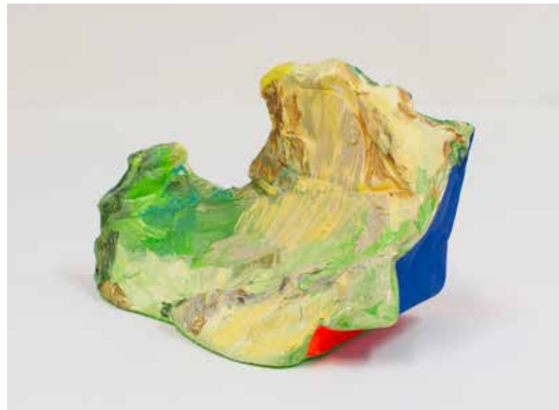
RIGHT: Mary Schwab Brydcliffe 2 , 2015 Oil, acrylic and flashe on white gypsum cement 3.5" x 3.5"