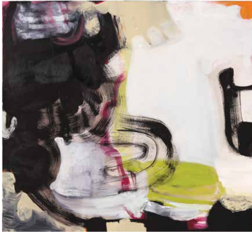
ABOVE: Patricia Spergel Inked 1 , 2014 Oil on canvas 30" x 32"