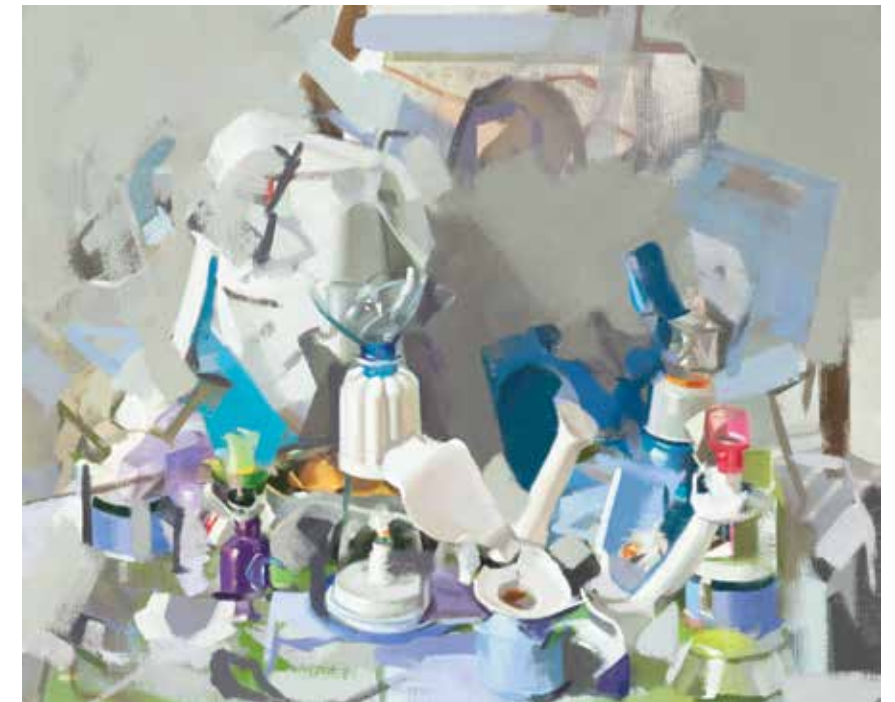
RIGHT: Amy Mahnick Blue Aggregate , 2015 Oil on linen 18" x 22"