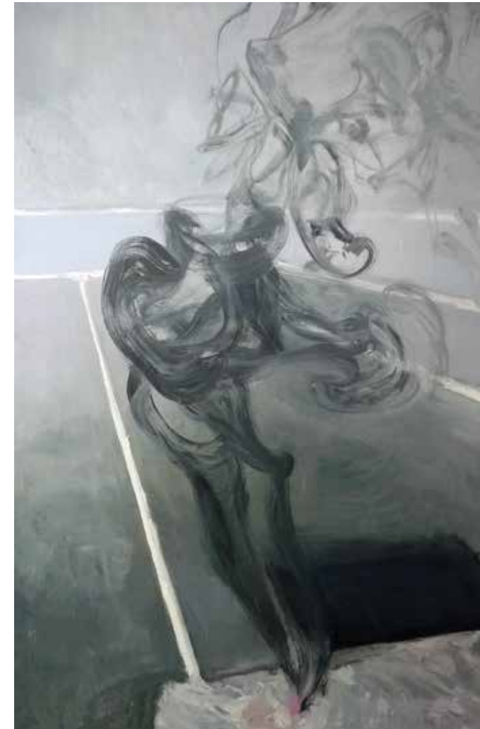
RIGHT: Timothy Linn Untitled , 1994 Graphite, gouache and pastel on vellum and paper 98" x 35"