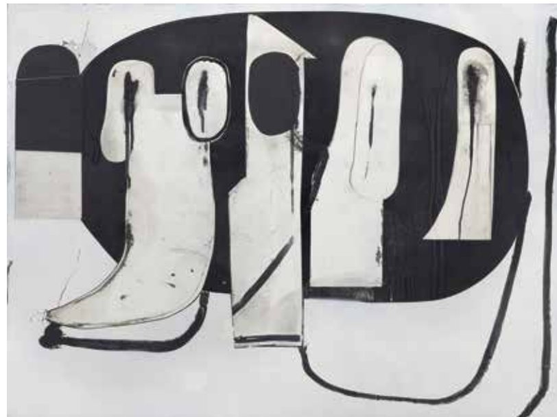
RIGHT: Hiroyuki Hamada Untitled Painting 002 , 2014 Acrylic, charcoal, enamel, graphite and oil on paper on panel 30" × 40"