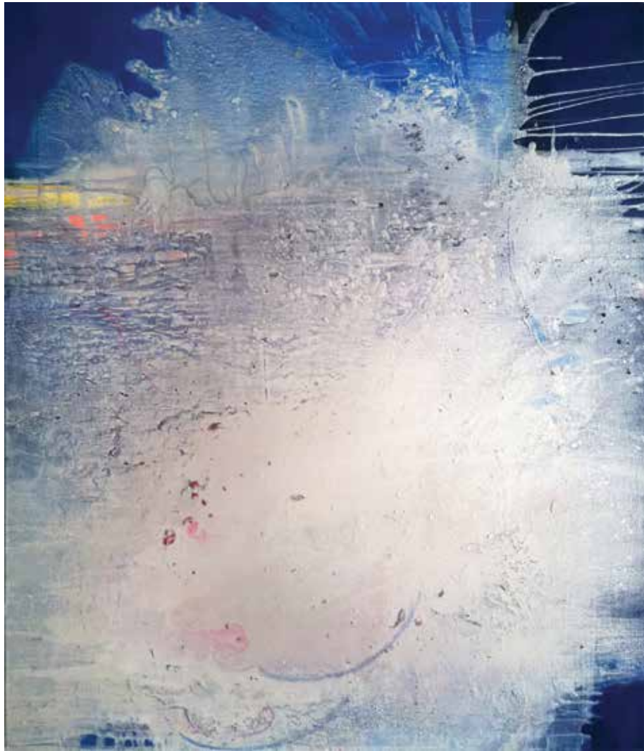
ABOVE: Sandi Slone Shoot the Blues Think Back into the Ocean , 2012–2015 Oil, acrylic and mica on canvas 68" x 58"