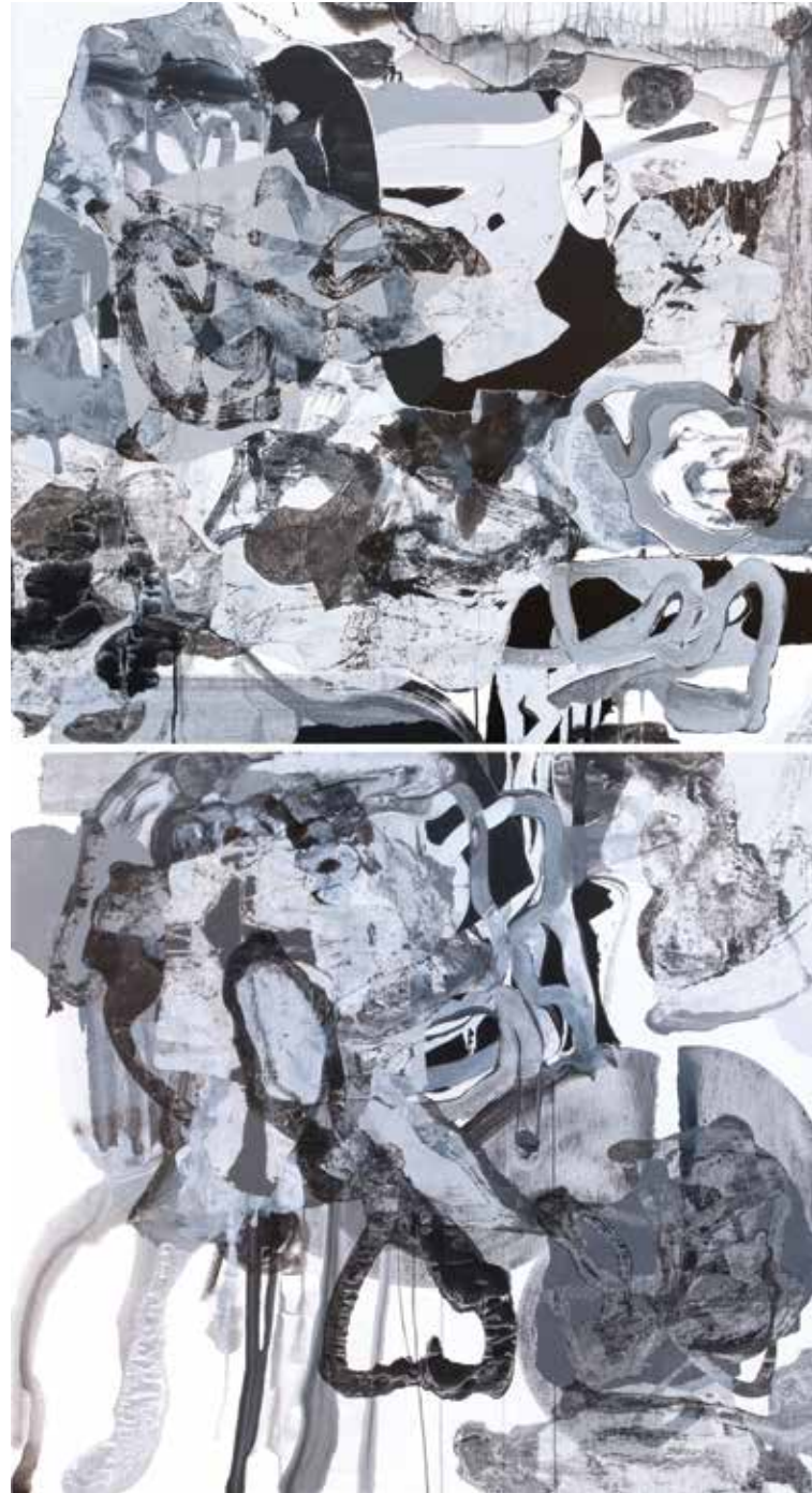
RIGHT: Zachary Keeting August 2, 2013 Acrylic on canvas (diptych) 101" x 54" Image courtesy of the artist and Fred. Giampietro Gallery, New Haven, CT