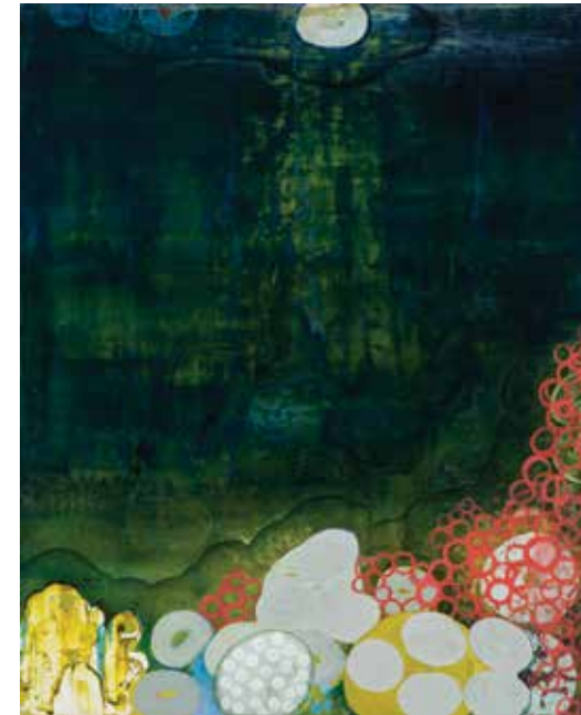
BELOW RIGHT: Judith Simonian Fleshy Pink Room , 2014 Acrylic on canvas 72" x 60"