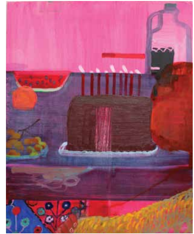
BELOW LEFT: Sarah Lutz Nocturne , 2015 Oil on panel 14" x 11"