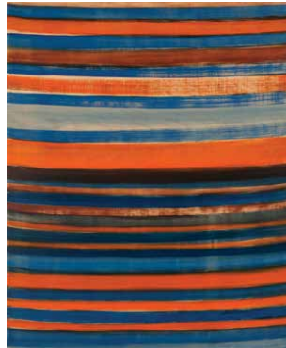
ABOVE LEFT: Emily Berger Twelve Bar Blues , 2015 Oil on wood 24" x 20"