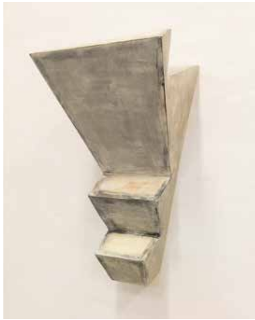
ABOVE: Sarah J. Tortora Ascendant , 2014 Plywood, pine, wood composites, acrylic and latex paint 29" x 16" x 14"