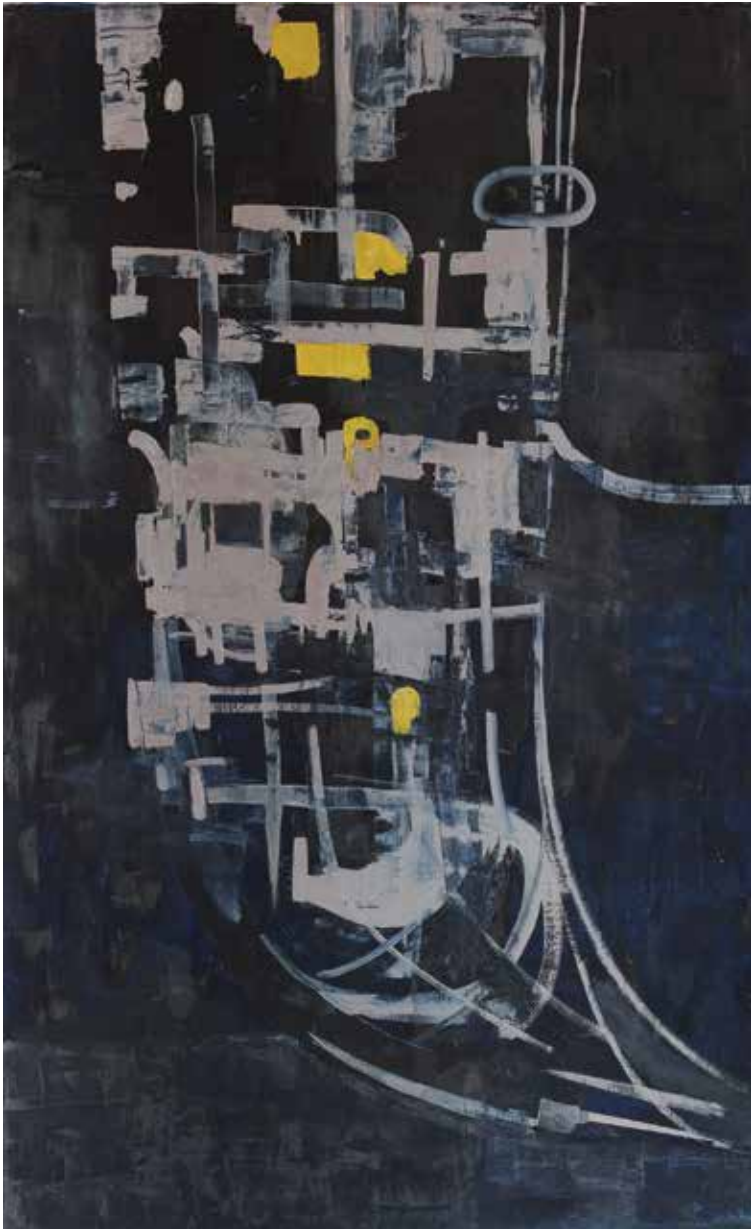
Andrew Baron Constellation , 2014 Oil on canvas 66" x 48"

COVER: Keiko Narahashi Untitled , 2015 Glazed ceramic 15" x 11" x 8.5"